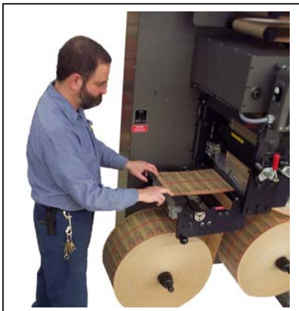
Horizontal web preparation!